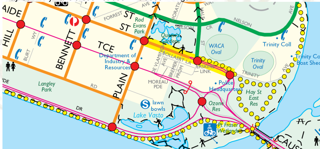
Figure 14 (page 26) does not show a cycle path on Hay St. Currently there is a shared path, and bicycle lanes on Hay St. Why have these not been included in Figure 14?

Above figure taken from DOT's bike maps which clearly shows the shared paths and cycle paths on Hay St.