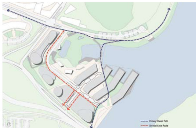
Figure 6: Illustrates the cycle network to be observed by all developments

Riverside Master Plan (published in 2008) also shows the provision of a primary shared path along Hay St, so why does the WACA guidelines omit a critical cycling path into Perth and along the Swan River.